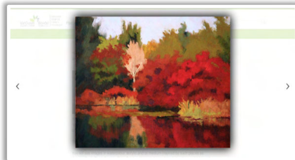
Image credit: VanDusen Botanical Gardens, Vancouver en Plein Air Group