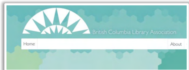
Image credits: Libraries, Archives and Museums Nova Scotia; BC Library Association